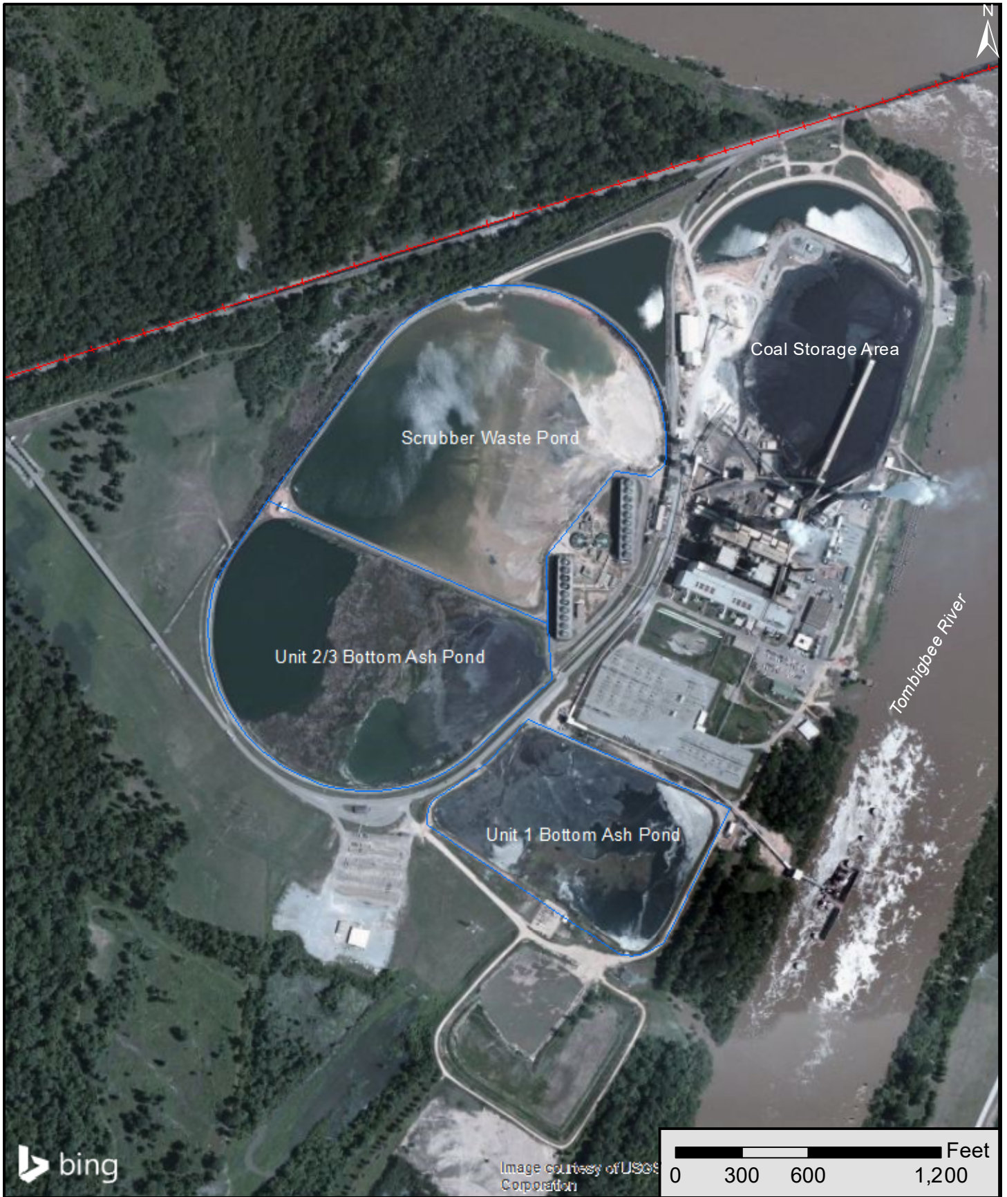
Figure 2 - Aerial Map of Impoundments Charles R. Lowman Power Plant PowerSouth Energy Cooperative Leroy, AL