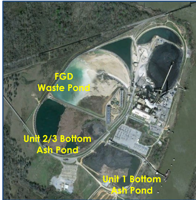
Figure 1 Identification of Ponds

The Charles R. Lowman Power Plant campus in Leroy, AL includes three impoundments for the storage of coal combustion residual (CCR) material. These are noted as shown in Figure 1.