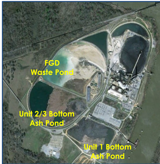
Figure 1 Identification of Ponds

The Charles R. Lowman Power Plant campus in Leroy, AL includes three impoundments for the storage of coal combustion residual (CCR) material. These are noted as shown in Figure 1.